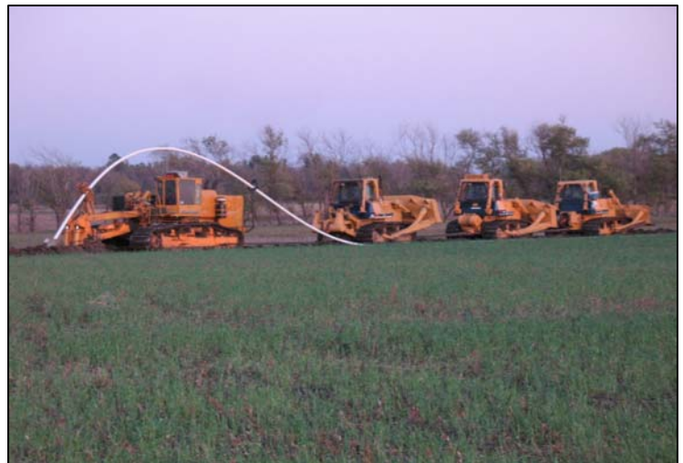
Plow train installing 4" water main

This project is in the process of design and State MR&I grant funding has been ap-