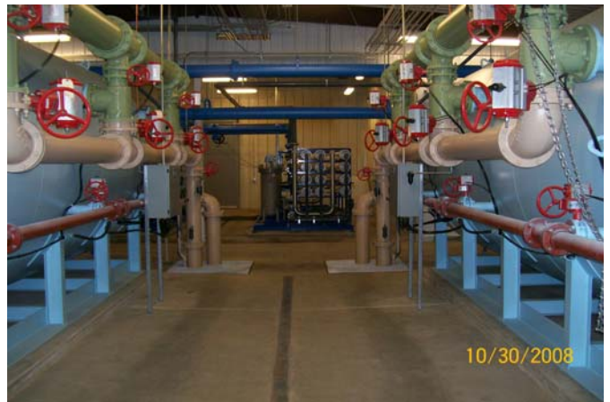
North Prairie Rural Water District's new state of the art water treatment plant near Voltaire.

Rural Granville/Deering will receive water treated by the City of Minot via NPRWD's and NCRWC's distribution systems.